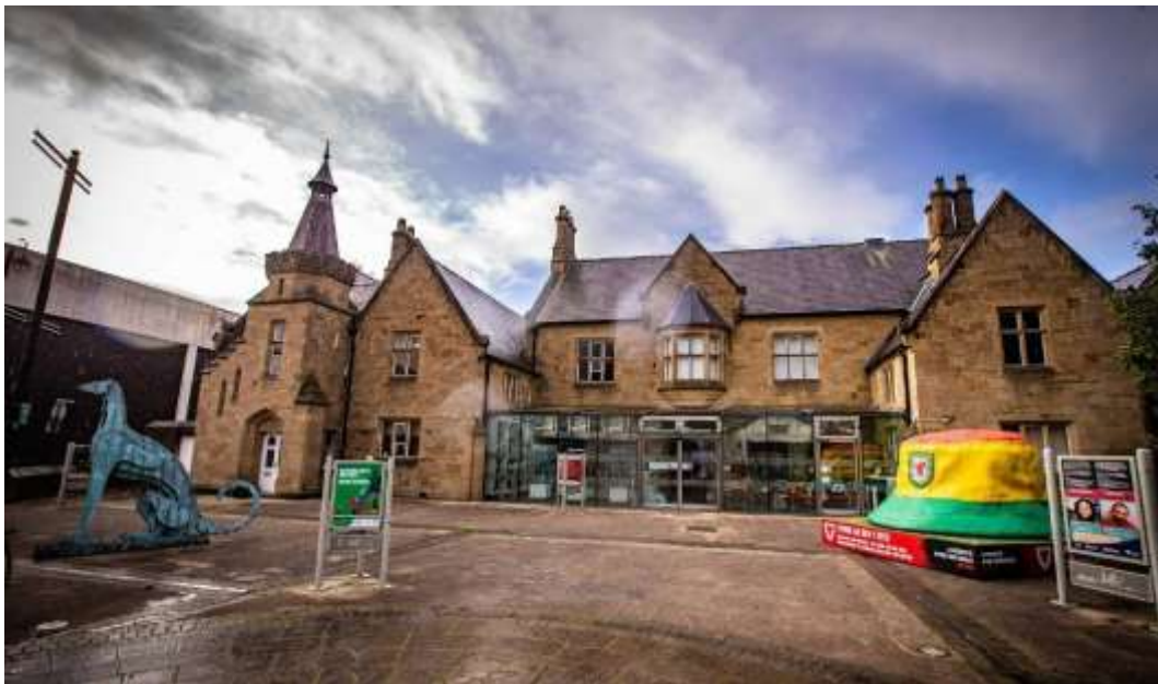
Wrexham Museum and Courtyard Cafe are now closed to the public.

This work can begin to prepare the building for redeveloping into the 'Museum of Two Halves' – a new football museum for Wales, alongside a fully refurbished Wrexham Museum.