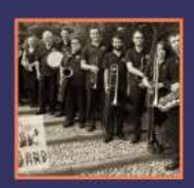
THE LITTLE BIG BAND