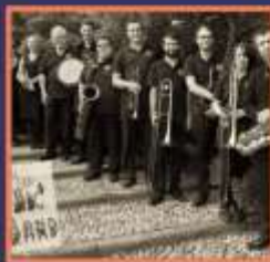
THE LITTLE BIG BAND