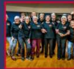
CHOIRS FOR GOOD WREXHAM

FRIDAY 26 MAY WREXHAM MEMORIAL HALL BODHYFRYD, LL12 7AG