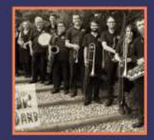
THE LITTLE BIG BAND