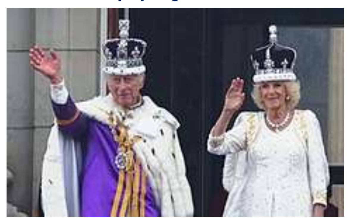
King Charles and Queen Camilla.

The bells also rang out at 10am, in St Mary's Church, Ruabon on Saturday 6<sup>th</sup> May, in celebration of the Coronation of His Majesty King Charles III.