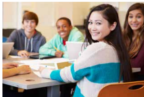
Options at 18