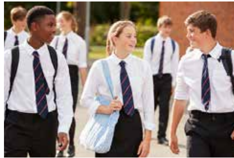
Choosing subjects in Year 8 and 9