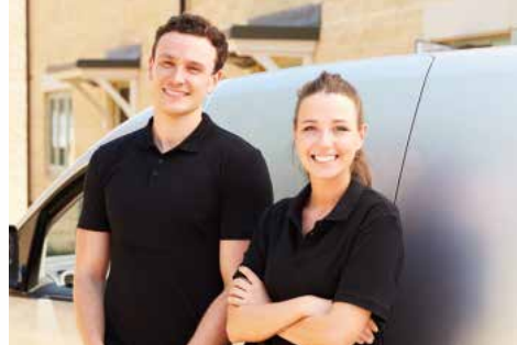
Getting into Self-employment