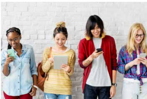
Options at 16