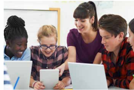
Choosing subjects and courses at 16