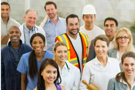
Getting a Job