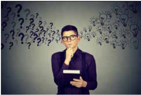
How to choose the right subject or course