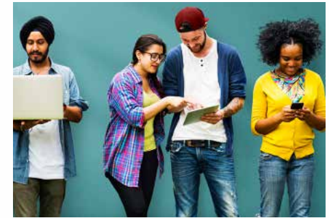
Choosing subjects and courses at 18