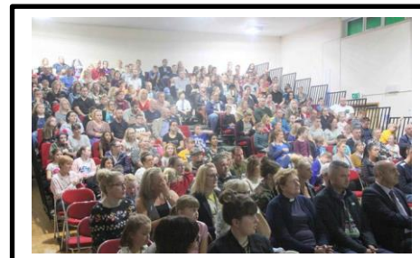
Full school hall