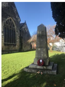
St Mary's Church, Ruabon