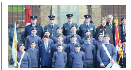
1251 (Berwyn) Squadron RAFAC

We were very proud of how our students conducted themselves during these two formal occasions.