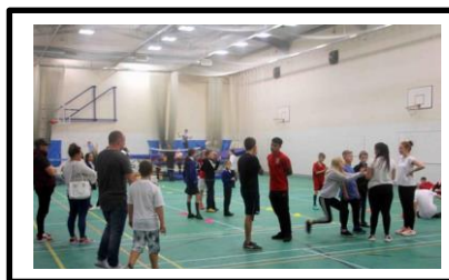
Sports Hall Activities