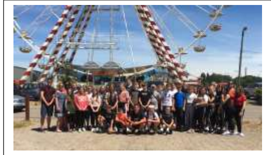
Day 1 in France

Very early on Monday 9 th July 40 students and 4 staff left Ysgol Rhiwabon to start their journey to France. After a long day of travelling they arrived safely at their hotel. The journey was broken up with a short trip to the beautiful town of Honfleur where some students took the opportunity to ride the big Ferris wheel located on the Marina. At the time of printing our students and staff are still having a fantastic time and we will update you further in our Christmas Newsletter.