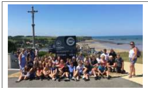
Day 2 in France

Very early on Monday 9 th July 40 students and 4 staff left Ysgol Rhiwabon to start their journey to France. After a long day of travelling they arrived safely at their hotel. The journey was broken up with a short trip to the beautiful town of Honfleur where some students took the opportunity to ride the big Ferris wheel located on the Marina. At the time of printing our students and staff are still having a fantastic time and we will update you further in our Christmas Newsletter.