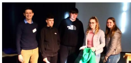
Year 12 Geography Group Students

Year 12 Geography group recently attended an enrichment day run by Aberystwyth University.