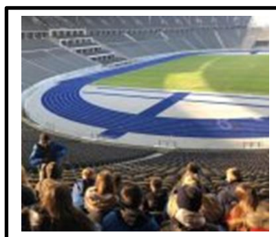
Visit to Berlin Stadium

We enjoyed a tour of the Berlin Olympic Stadium, old and new and were able to see some examples of post-war de-Nazification. Finally we had a guided tour of the Bundestag formally known as the Reichstag where we learnt about German politics and the modernisation of the German parliament building.